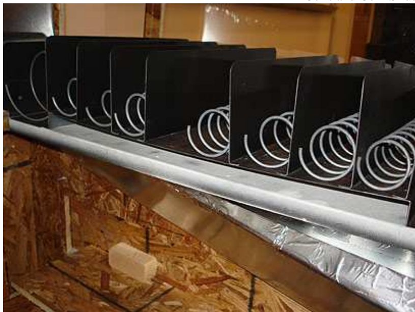
Coils and Coin Slide

Dealing with the integration of the vending system created an opportunity to work hands-on with problem solving. Security issues were solved by designing the vending system into a removable locked drawer that dropped the snack down a ramp far enough away from sneaky hands attempting to reach into the system. The non-electronic vending machine was gutted, stripped of its shell, and placed into the side of the cabinet where the coins from the mechanical knobs would drop down a metal slide and through a PVC tube which would trigger a micro switch. This electronically linked the action of vending with a coin credit that would be used to play back a free game on the emulator.