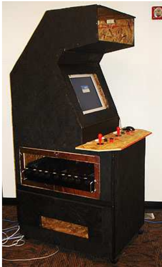
Snack Attack after Phase 2

The project is currently moving into its second phase, in which new features are being added to the system. The team is attempting to move beyond the original vending problem and create a platform for other students to continue work on. Plans are in the works to design a magnetic card-based stored value system which will be connected to a MySQL database and integrated into the mechanical coin system. This will be achieved by isolating one or more rotating coin knobs and connecting them to a motorized system. The database will not be located in the machine itself, but accessed remotely so that academic exercises can potentially be performed in a decentralized manner. The original PIC microcontroller project may have relevance in this later work by providing the medium for this customized program code. Another benefit that was realized after construction was the possible implementation of student created games being showcased on the platform. These could easily be programmed to operate on a credit based system, and the keyboard controls would easily map to the keyboard-hacked control panel. By combining the different disciplines in the IT curriculum within the Snack Attack platform, creative projects can be assigned in software development, networking, and database implementation.